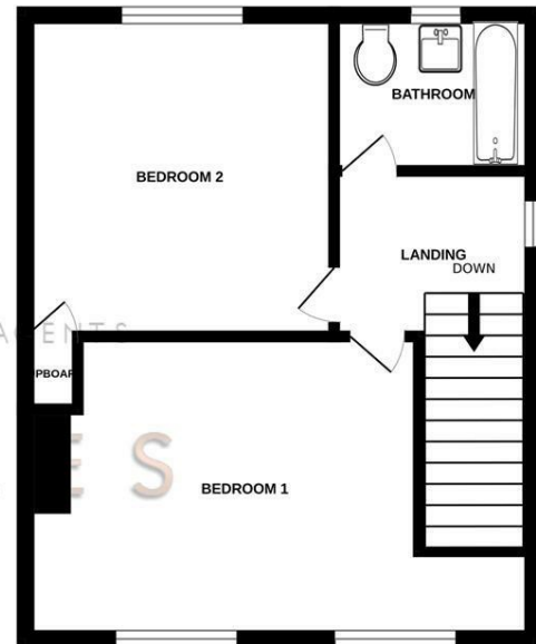
1ST FLOOR 347 sq.ft. (32.2 sq.m.) approx.